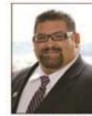
Felipe Hernandez Mayor, City of Watsonville