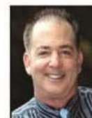
Ed Bottorff Mayor, City of Capitola